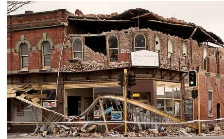
Reshaped by natural force