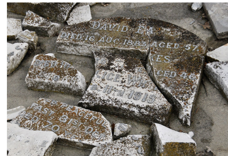
Fragments of a life