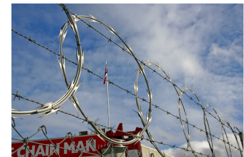
Sharp and lethal