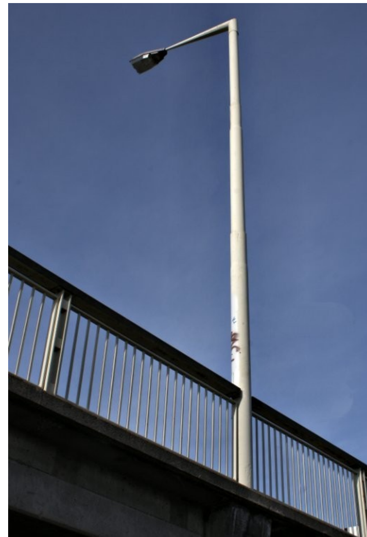
Light Pole Colombo St Overbridge

It would be great if you could email it to me no later than 23 November.