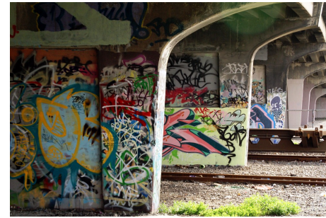
Under the Overbridge