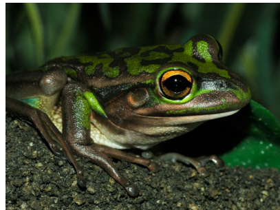
Green and Golden Bell Frog