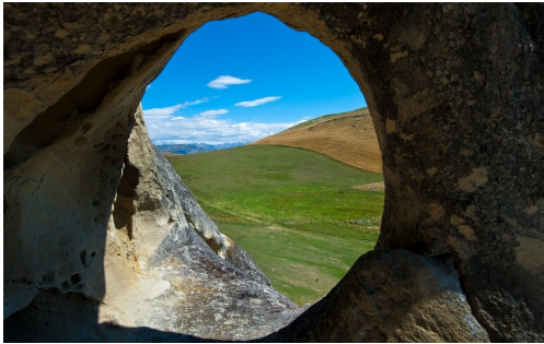
View through the round window