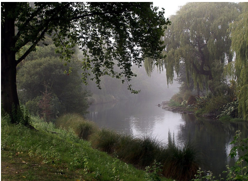
Early morning mist