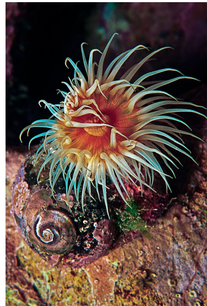
Jewel Anemone