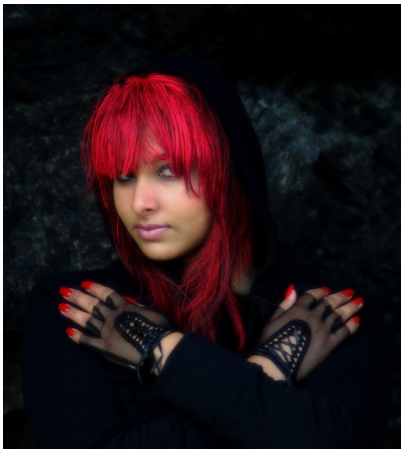
Cross my heart