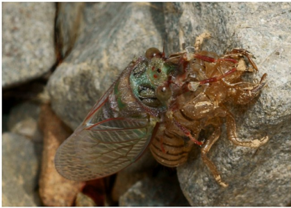
Cicada Emerging From Nymphal Skin