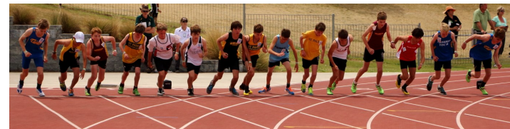
Colgate Games 13 Year Old - 1500 Metres - by Paul Koster