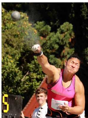
The Power of Adams