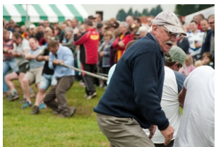
Heave Boys, Heave