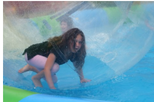
A girl in the Bubble