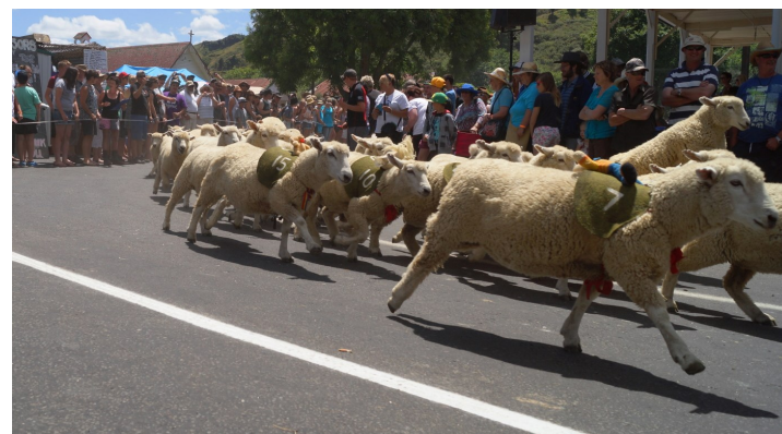
The Main Street 3.15 at Whangamomina - by Guy Wright