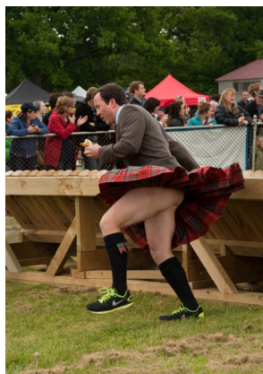
Traditional Attire HororataHighland Games