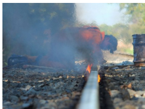
Heat of the Moment