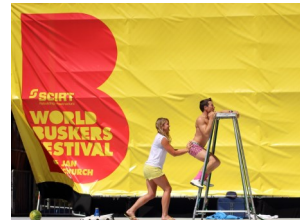
Need a Hand