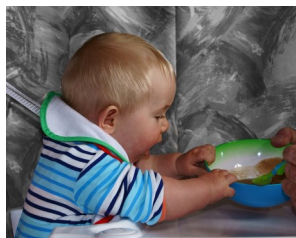
Just give me the bowl