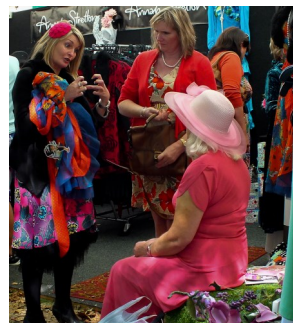
The Hard Sell