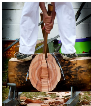
The Last chop