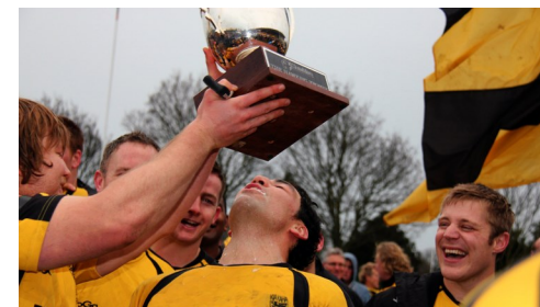
The Sweet Taste of Success